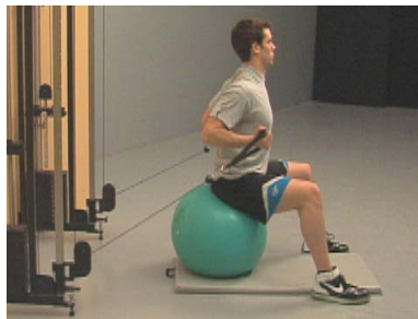
Ball Bicep Curl