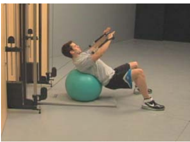
Ball Chest Press